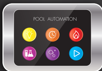
POOL CONTROLLER COMPATIBLE*